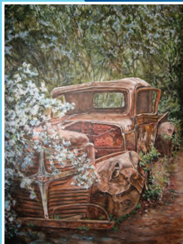
Painting in Watercolor