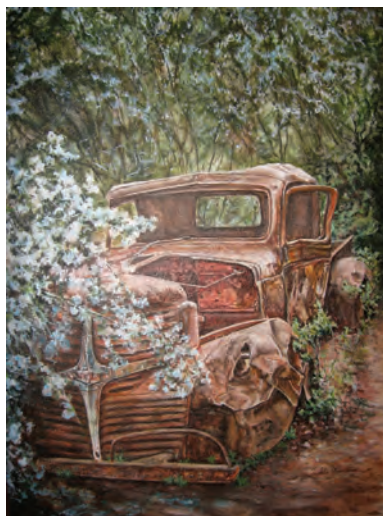
Painting in Watercolor

$99 | Jessica Minckley SMC Main Campus, Art 100 Sat 9:30a – 12:30p Sep 20 – Oct 25