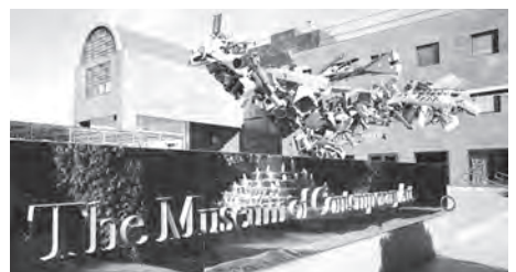
MOCA Grand Avenue